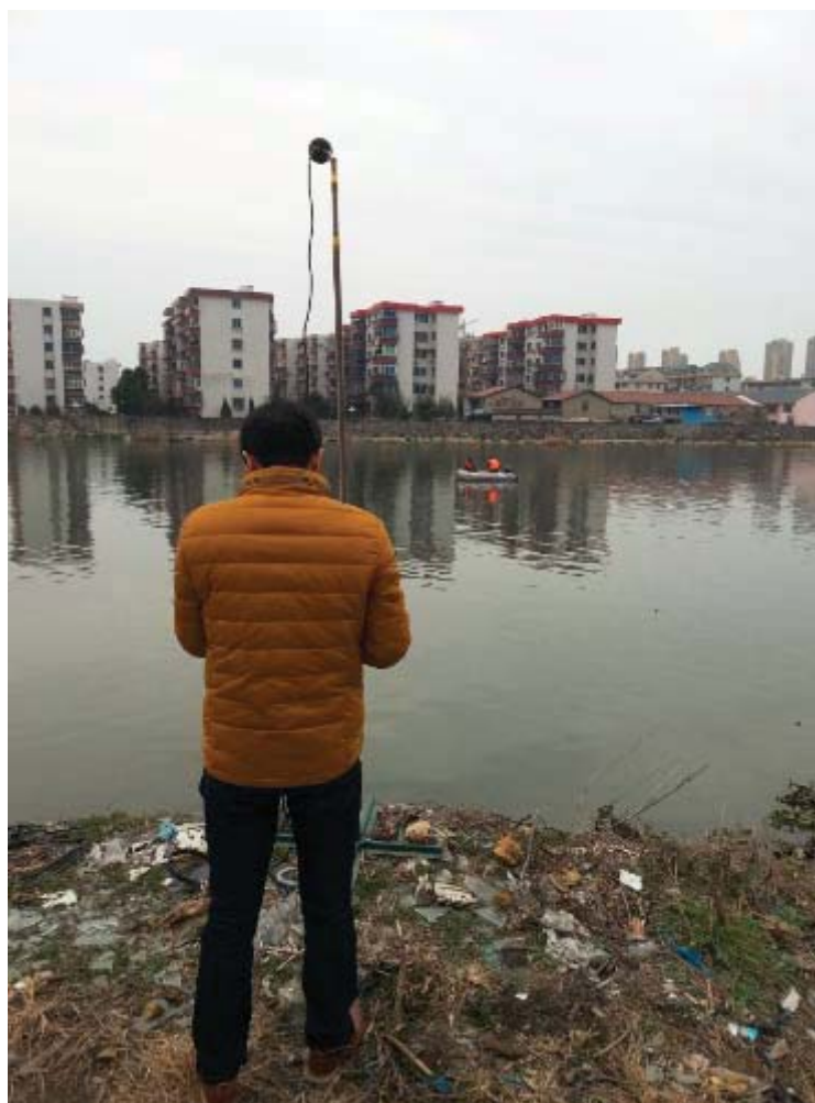
PHOTOGRAPH OF F6 TESTING SETUP